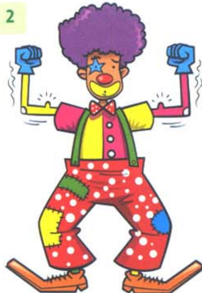
_____ my arms.