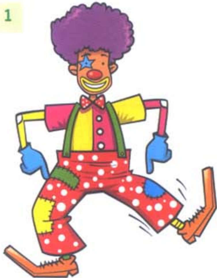
These are my legs.