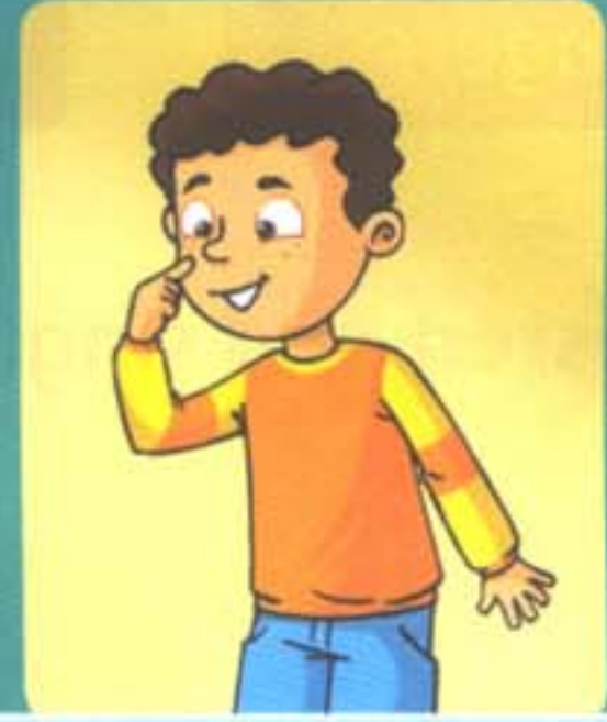
This is my nose.