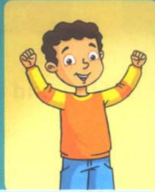
These are my arms.